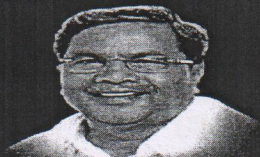
Sri Siddaramaiah Hon'ble Chief Minister