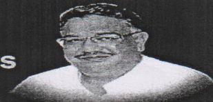
Sri Tanveer Sait Hon'ble Minister for Minorities Welfare, Wakt, Primary & Secondary Education

Gain more knowledge Reach greater heights